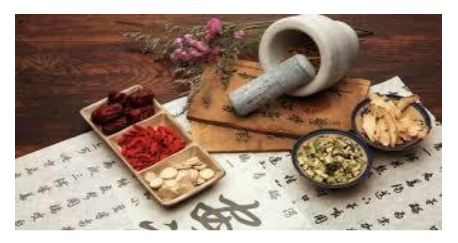
Figure 2: Chinese herbal medicines

Chinese herbal medicine contains ginkgo and ginseng. Ginseng medicine is used for a specific treatment. It is used to restore balance to the body as a whole. This medicine can be taken in some form like pills, powder, and tea can also be taken along with it [8].