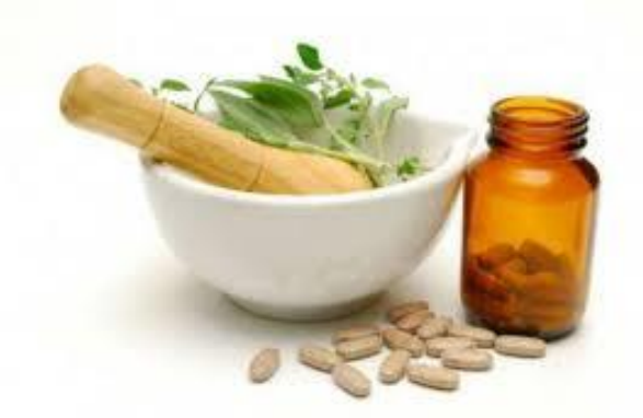
Figure 1: Ayurveda medicine