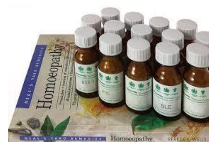
Figure 3: Homeopathy Medicine