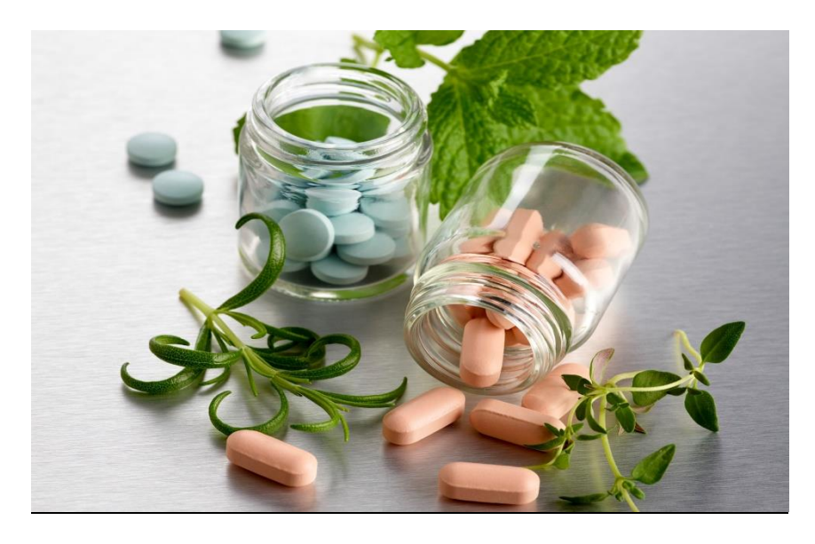
Figure 4: Homeopathy remedies

Some of the principles are produced after Homeopathic remedies. Whenever any remedies are made in homeopathic it is made again and again so as to provide a good result. We can adulterate remedies with matter 1000 times. We can dilute remedies from 1000 to 10000 times. Homeopathic has been told from the beginning to detail all the experiments that were done on the patient. There is something in it like physical question also from like mentally, emotional or is there an emotional illness [11].